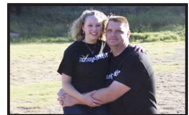
A Retreat Team of Two